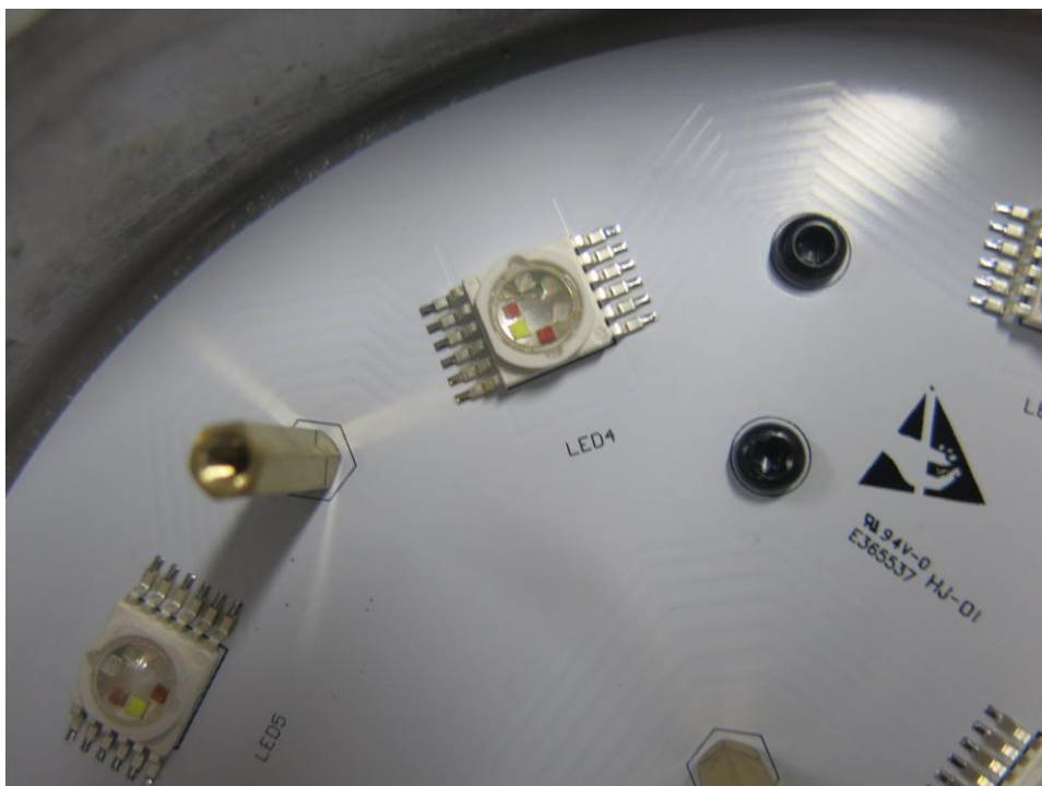
Fig 2 - LED view