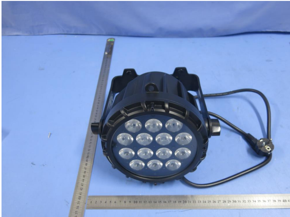
Fig 1 - Front overview