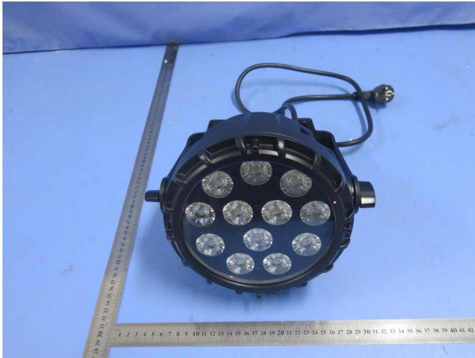
Fig 1 - Front overview